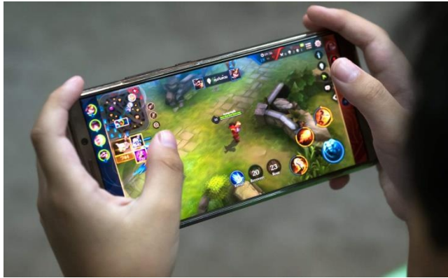
1- On Sundays, my older brother