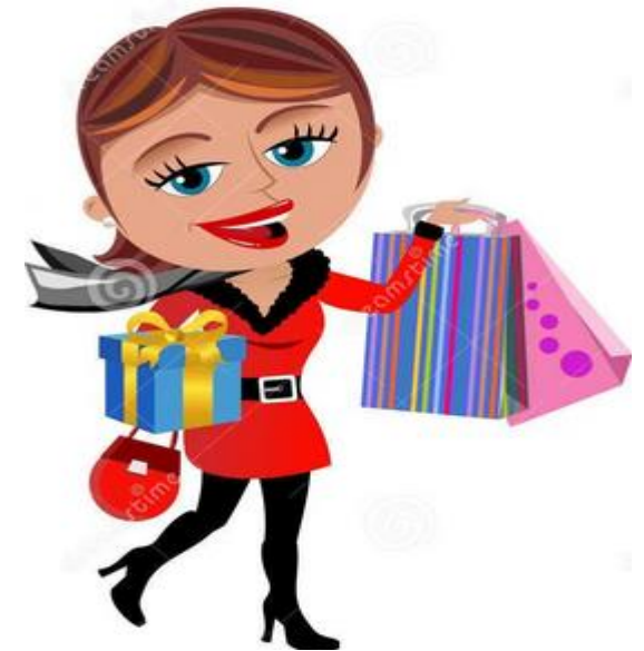
5- My sister .....