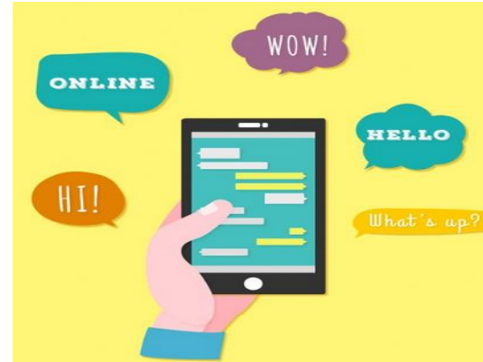
2- In my free time, I .....