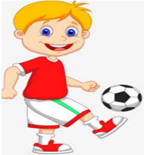
3- My friend ..... play mobile games. He .....